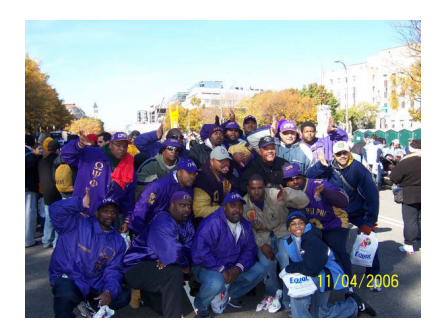
Mu Nu Chapter Brothers participating in the 2006 Walk for Diabetes

Mu Nu Chapter was chartered May 23, 1970, in Rockville (Montgomery County), Maryland.