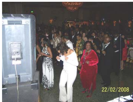
Brothers and Guest enjoying a dance at the 2008 Iota Nu Mardi Gras