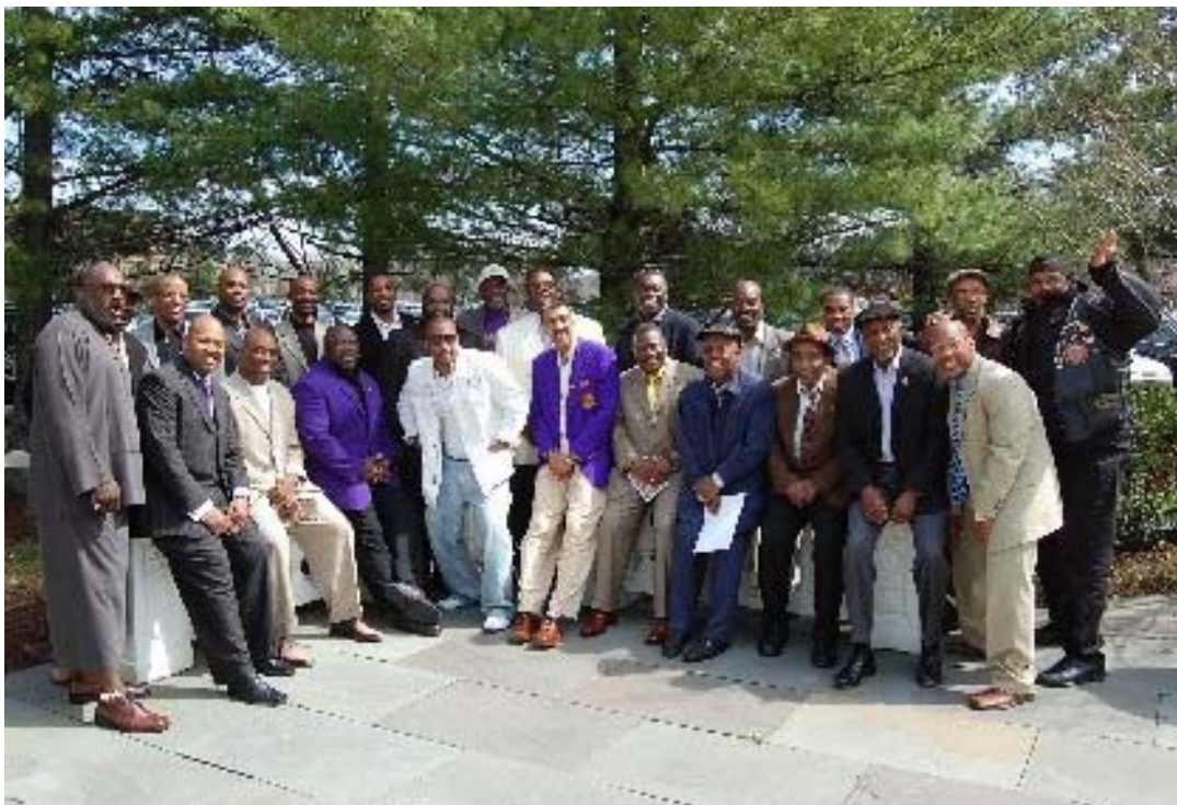
Chi Upsilon Brothers pose for a group photo after the Jazz Brunch