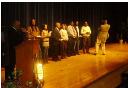
Gamma Pi Talent Hunt Contestants

Prince George's County, Md. - So much of the news about our youth is negative and depressing. From crime and violence to the phenomenon of "babies having babies," the headlines are filled with stories of young people who are experiencing dwindling opportunities before they can even reach their 21 st birthday. But Gamma Pi chapter recently showcased some of the best and brightest talent in its home territory of Prince George's County, thanks to the successful 36 th Annual Omega Talent Hunt program held March 8 at Charles Herbert Flowers High School in Springdale, Md.