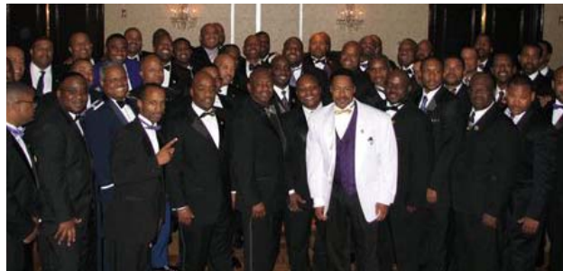
Lambda Gamma Gamma Brothers at the Achievement Week Celebration