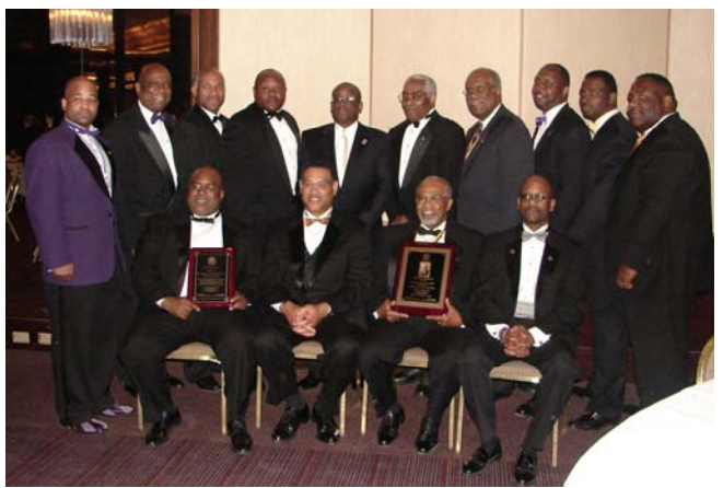
Pi Omega Brothers in attendance at the 59th Second District Conference Founders Banquet held in Pittsburgh, PA