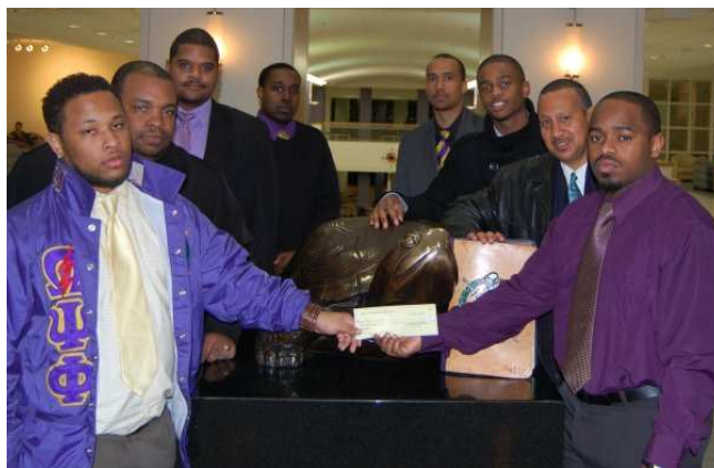
Chi Delta Chapter Brothers and Alumni hold $1000 check donated for Haitian Relief

Hot & Hazy Mardi Gras. Specifically, through the sale of Mardi Gras masks we were able to raise money that can now go towards Haitian relief efforts. Hopefully our donation of $1,000.00, will not only help the cause, but inspire other brothers and chapters throughout the fraternity to make similar contributions."