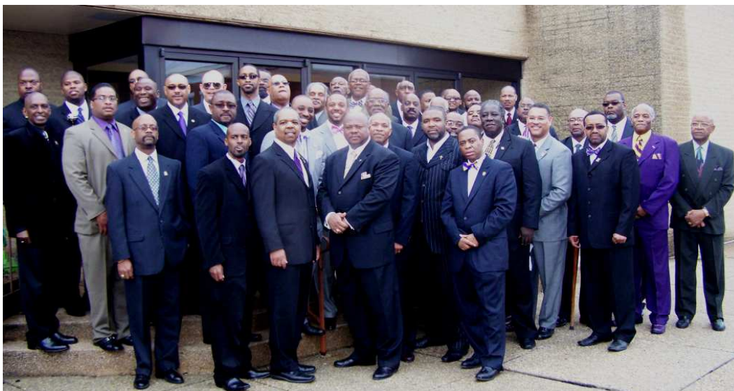
Pi Omega Brothers in attendance at Memorial Service in front of Southern Baptist Church