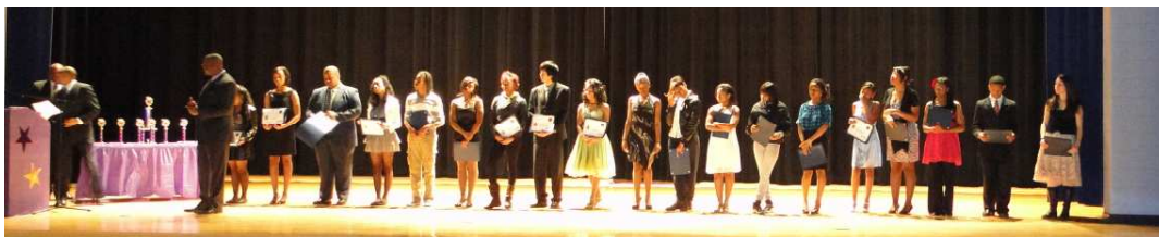
Group photo of Contestants at Lambda Gamma Gamma's Talent Hunt Competition