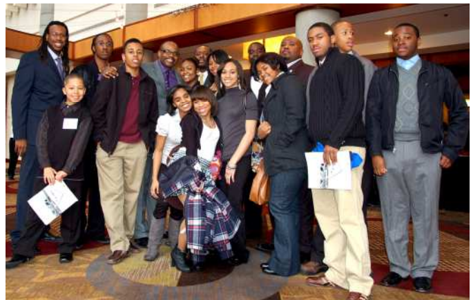
Brothers of Theta Mu Mu Chapter along with teens attending the summit

Theta Mu Mu brothers aided in a vast array of duties which included registration, traffic patrol, hallway monitoring, and event guiding. Over 700 students were in attendance, representing 101 different high schools and 69 different middle schools from the Baltimore Metropolitan Area. The Summit, a first-of-its-kind "teen" conference, provided a safe and creative learning environment for the exploration of new ideas, leadership skill development, and confidence building workshops