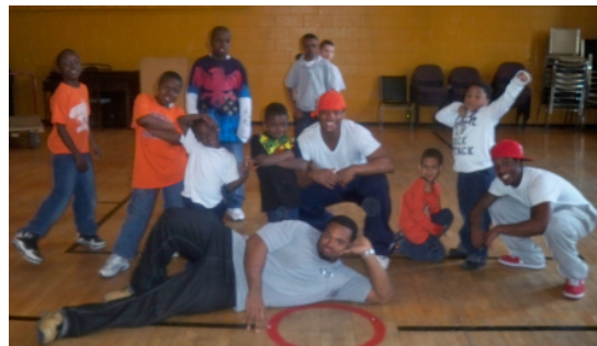
Kappa Chapter Brothers with kids at the Dunbar Center