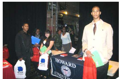
Students attending the HBCU College Fair

On Sunday November 15, 2009, in partnership with the NJ Department of Education, NJ Department of Labor and Workforce Development, NJ Amistad Commission, Macedonia Baptist Church of Newtown, PA, NJ Commission on Higher Education, and the United States 2010 Census, Delta Upsilon Chapter, Trenton, NJ hosted the fourth annual Malcolm Bernard Historically Black Colleges and Universities College (HBCU) College Fair and Ecumenical Service. This program attracts more than 40 HBCU's and 1500 parents and students seeking information about college entrance requirements, financial aid, and current job market trends. The goal is to get area high-school students and their parents informed about black colleges and universities, financial aid, and scholarships.