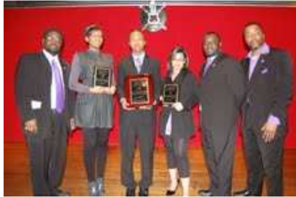
Phi Omega Brothers pose with Talent Hunt Winners

and many guests to fraternize for a common goal: The Education of Our Young People. The Ball is always very well attended and all proceeds minus costs incurred go toward the scholarship foundation. The Phi Omega Chapter is excited about the 2010 Ball but even more about the opportunity to continue to be about the business of Omega.