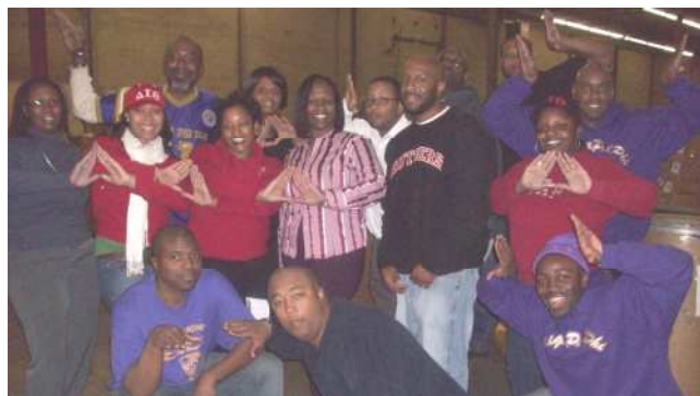
Omega Brothers and Delta Sisters working together to "Feed the Children"