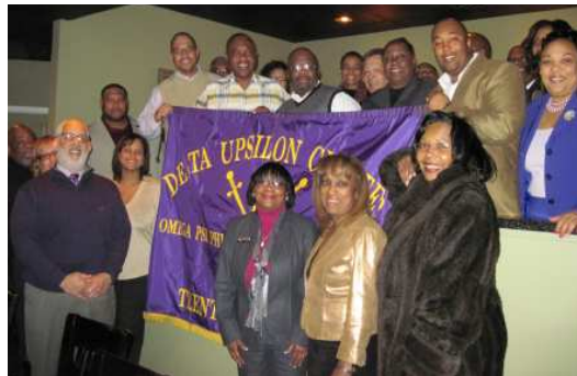
Brothers and guests at the 60 th Birthday party celebration for Delta Upsilon Chapter

January 31, 2010 Trenton, NJ. Delta Upsilon Chapter celebrated its 60 th year in the Fraternity. The Chapter celebrated this occasion with a Chapter Founders Day dinner for Brothers and their significant other at a local restaurant. Nearly 3 dozen Brothers and guests enjoyed a delicious meal and great conversation in the true spirit of Friendship and Fraternity. The Brothers also had an opportunity to acknowledge the Chapter founders with a special prayer.