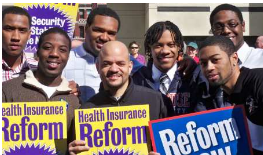
Kappa Chapter Brothers at the Federal Building in downtown Syracuse to hand out postcards and show political support for Health Care Bill

Syracuse, NY. On March 21 st , the Brothers of Kappa Chapter participated in an event called ‘Bowling for Kids Sake’ with 4H at Peace Inc. Many underprivileged children are involved in a mentoring system that Peace Inc. has through their Big Brother/Big Sister program. The mentoring system is used in order to uplift and guide those children in a positive manor and hopefully be an inspiration for them to achieve their maximum potential. The Brothers were assigned to serve food to all of the visitors and fellow volunteers, while some were assigned clean-up duties, bowled with the youth and helped take pictures near the photo booth.