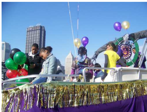
Children playing on the Iota Phi Parade Float at the African American Heritage Parade

No less than 20 Brothers participated while passing out brochures informing the public about the serious health issue of prostate cancer. The younger Brothers amazed the crowd at every block with the high-knee/low back renditions of traditional old school steps and new hops.