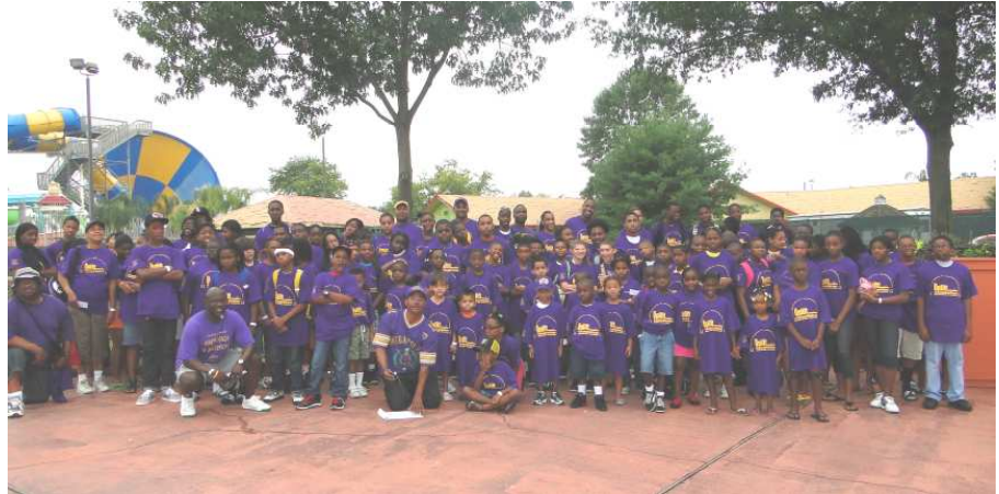
Kids and Chaperones at the LGG's Kids Day at Six Flags

This year's event was sponsored by: First Priority Bus Service, Omega Gold Devel-