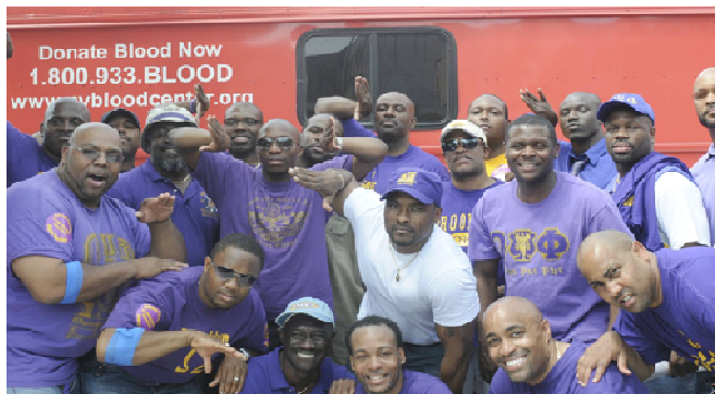
Alpha Upsilon Brothers at their 3rd Annual Charles Drew Blood Drive

Alpha Upsilon Chapter celebrated her supporters as they come out and enjoyed a block party, which included good food, good music and a time for bonding in brotherhood all while serving a noble cause. The 3rd Annual Dr. Charles R. Drew Blood Drive is a mandated program for Omega Psi Phi Fraternity Incorporated. Other mandated programs include Achievement Week, College Endowment, NAACP, Social Action, Talent Hunt and Voter Registration.