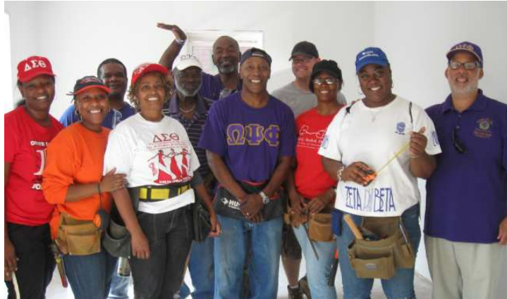
Delta Upsilon Brothers along with Delta's and Zeta Sorors working together with Habitat for Humanity in Trenton, NJ.

After a short orientation and filling out the volunteer forms, the HFH Construction