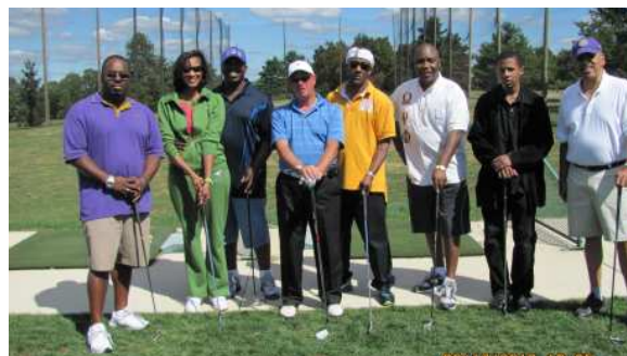
Attendees participate in lessons at Delta Upsilon Annual Golf Outing at Mountain View Golf Course, Ewing, NJ.

Many prizes, gifts and awards were handed out to the winners. This was one of the most outstanding community and name recognition events Delta Upsilon hosted throughout the year