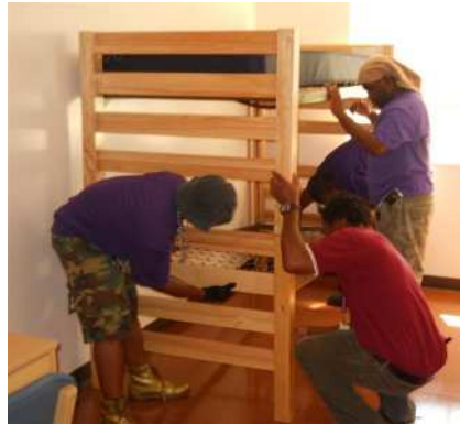
Theta Mu Mu Brothers assemble beds at the SEED Dorm Move In

Baltimore, MD. August 29, 2010. The Brothers of Theta Mu Mu Chapter (Baltimore County, MD) joined by the ladies of Rho Xi Omega Chapter of Alpha Kappa Alpha Sorority, Inc. helped students move into their dorms at the SEED school of Maryland. The SEED School of Maryland is a new statewide college-preparatory public boarding school that opened in August 2008. It currently serves 240 students in grades 6 through 8. The school will grow to serve 400 students in grades 6 through 12. SEED is an extraordinary opportunity for students from across the state to receive a tuition free, college preparatory, boarding education. Ladies of Rho Xi Omega helped students unpack their luggage, passed out water/snacks, and participated in an "Extreme Dorm Makeover". Brothers of Theta Mu Mu carried boxes,