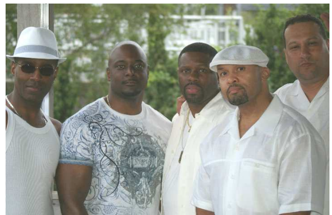
Brothers of Zeta Psi Chapter