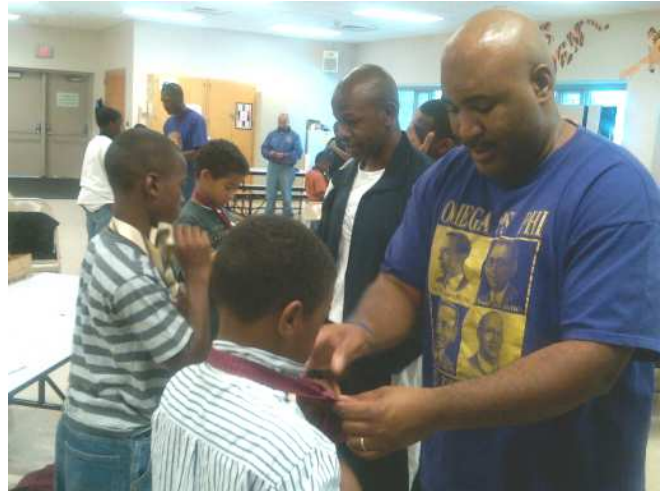
Tau Pi Brothers teaching young men to tie neckties.

Also on this Saturday, the mentors take the time to teach the young men how to properly tie a necktie. The goal is to teach these young men in both the realms of academics and social development.