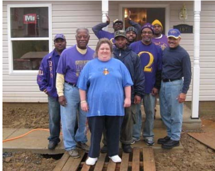
Members of the Iota Nu Chapter, along with one of the future owners of the Habitat for Humanity Project.