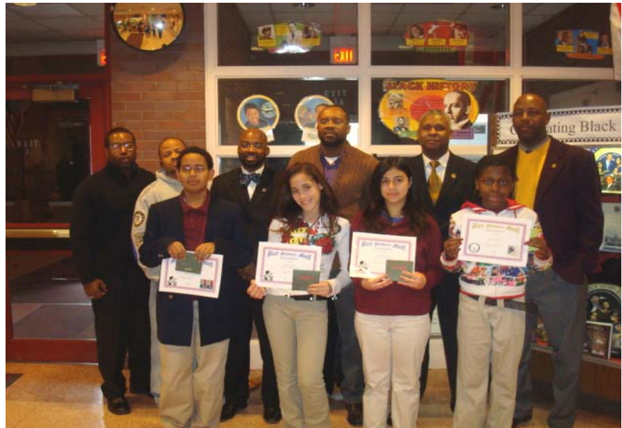
Nu Lambda Lambda Brothers with Essay Contest Winners