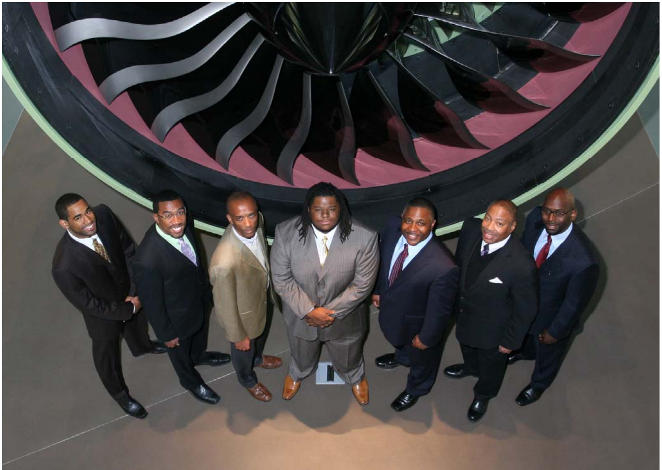
Omega4Life Inaugural Class with General Electric Mentors

International Chairman-Career Opportunities Committee