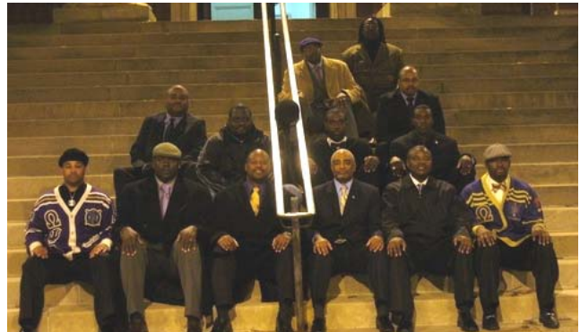
Theta Mu Mu Brothers celebrate Founders Day at Howard University