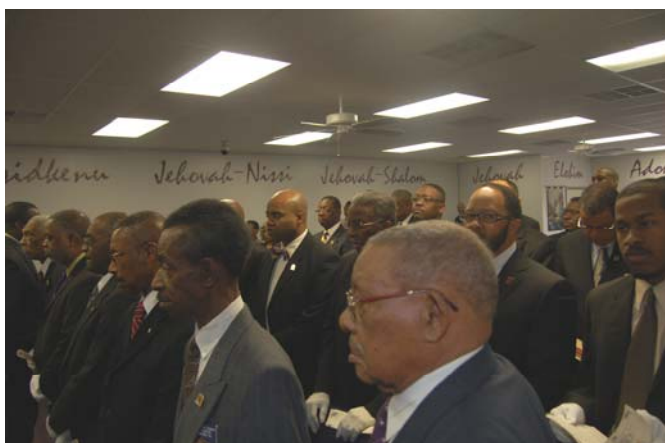
Nu Nu Brothers in unity at the Memorial Service.

"A Brother leaves the chapter rolls, and moves to other worlds; For when we say our last good-bye, He walks on streets of pearls."