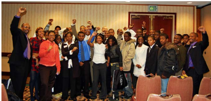
Theta Mu Mu Brothers pictured with youth participating at Youth Leadership Teen Summit on President's Day